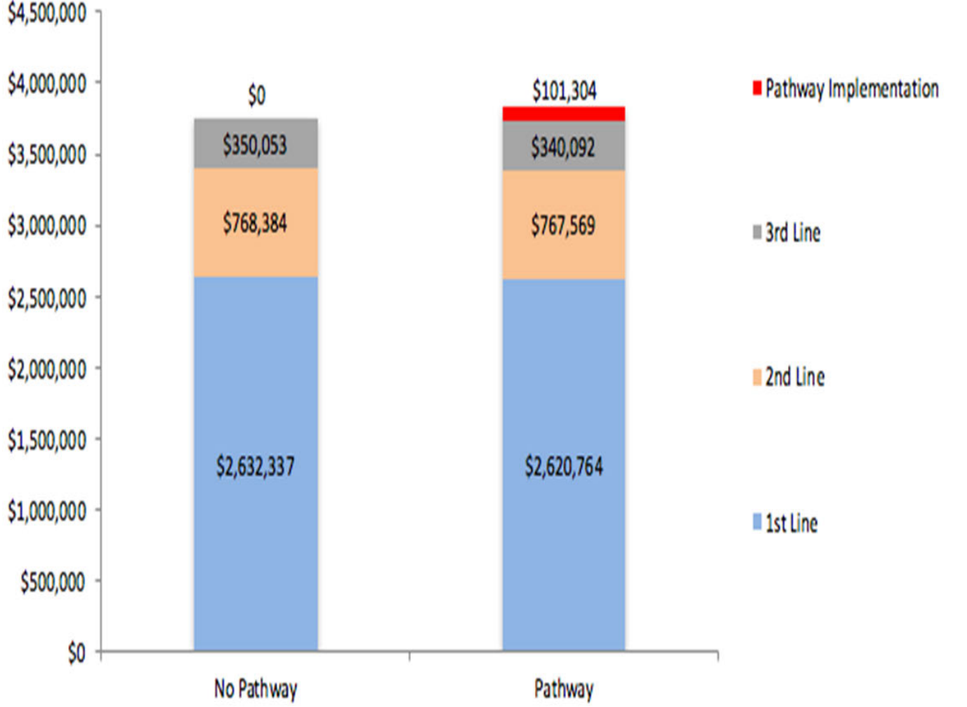
Figure 2. Annual Costs by Line of Treatment: With vs. Without Pathway Implementation

<sup>a</sup> Values based on averages from prescribing information for all products